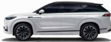
Khaki White with Black Roof