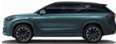
Olive Grey with Black Roof